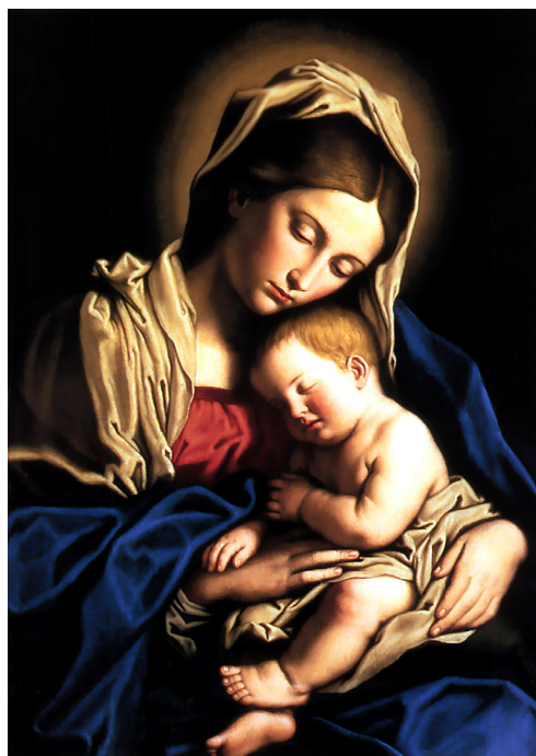
Madonna and Child Giovanni Battista Salvi da Sassoferrato (1609-1685)

The State Officers wish all a Blessed and Merry Christmas. At this time of the year, we think of the birth of our Lord, Jesus Christ. We hope that you and your family enjoy many graces from our Blessed Lady and her Son, Our Lord Jesus Christ, in 2013.