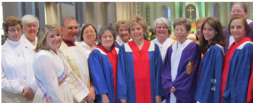
Attendees at Patriotic Rosary