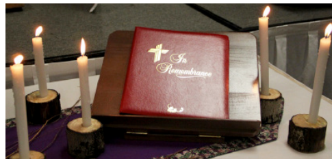
Delegates remember those who have gone before us. The book of remembrance was placed on the altar. All those whose names have been inscribed have been especially remembered at all our Eucharistic Celebrations during the Convention. May they rest in peace.