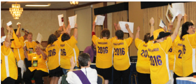
PA delegation skit to promote 2016 National Convention in Pittsburgh