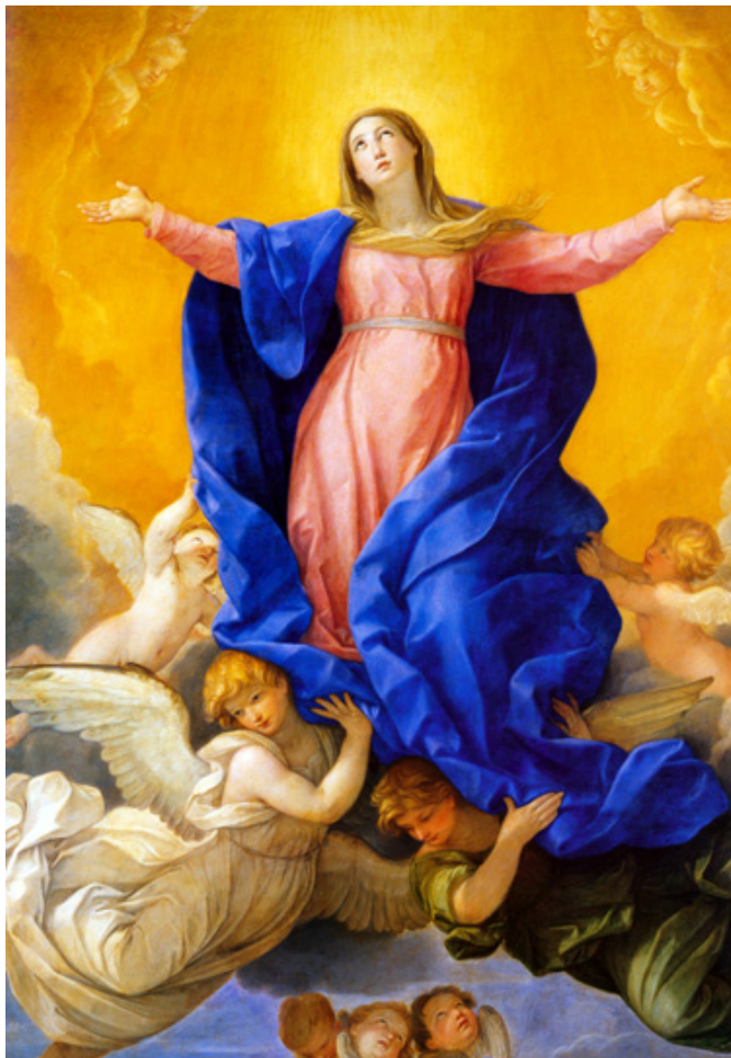
Assumption of the Virgin Guido Reni 1575-1642