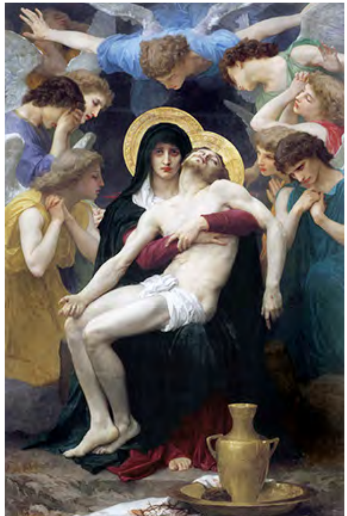
Pieta (William-Adolphe Bouguereau 1825-1905)