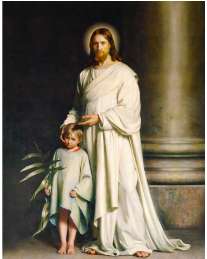
Jesus and the Small Child