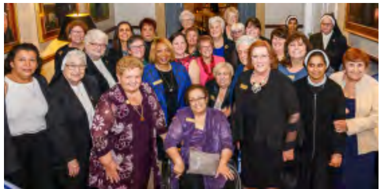
The National Board, New York State Board and many members from New York Court St. Margaret Mary attended the SOAR dinner

The gala, held at the New York Athletic Club, is a major fundraiser for SOAR! which provides grants to religious congregations to meet the immediate needs of their retired and infirm members.