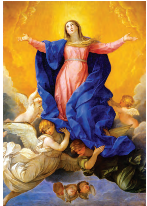
The Assumption of the Virgin Guido Reni (1575-1642)

In you, O Mary, is fulfilled, as we can bear it, an original purpose of the Most High. He once had meant to come on earth in heavenly glory, but we sinned; and then he could not safely visit us, except with a shrouded radiance and a bedimmed majesty, for he was God. So he came himself in weakness, not in power; and he sent you a creature, in his stead, with a creature's comeliness and luster suited to our state. And now your very face and form, dear Mother, speak to us of the eternal; not like earthly beauty, dangerous to look upon, but like the morning star, which is your emblem; bright and musical, breathing purity, telling of heaven, and infusing peace. O harbinger of day! O hope of the pilgrim! Lead us still as you have led; in the dark night, across the bleak wilderness, guide us on to our Lord Jesus, guide us home.