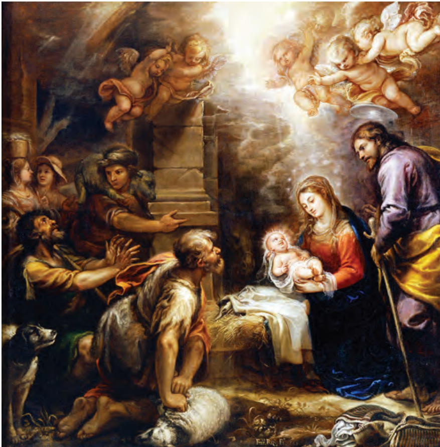
Adoration of the Shepherds Francisco Rizi (1608-1685)