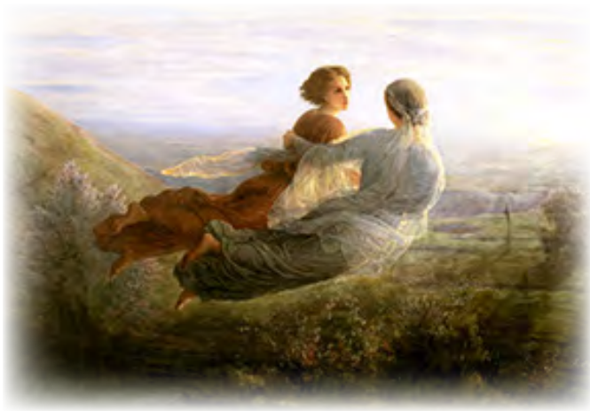
The Soul's Flight Louis Janmot 1814-1892