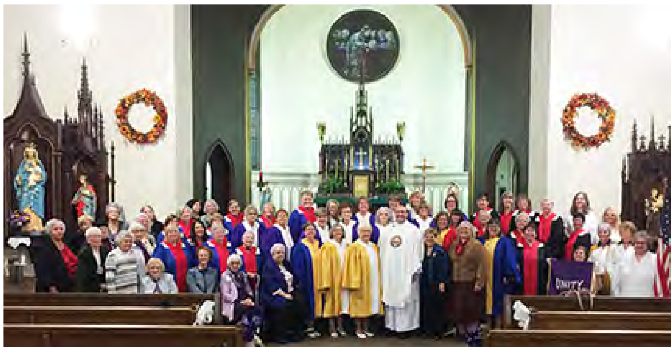
Celebrating 110 Years!—Pennsylvania State Court