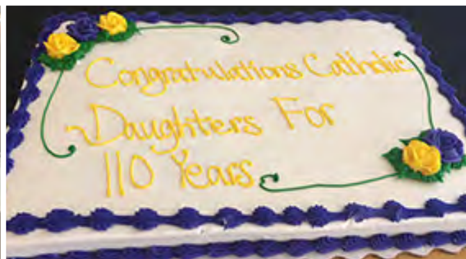
Congratulations, PA Catholic Daughters for 110 Years! That's Awesome!