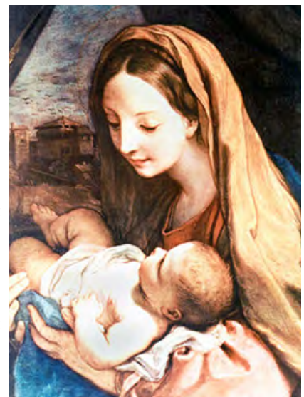
Madonna and Child

We know that nothing compares to His presence in our individual lives and in our sometimes dark world. Jesus already came once when, in time, he was born in Bethlehem. Now we wait for his second coming, again