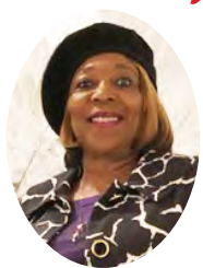
National Second Vice Regent and National Representative