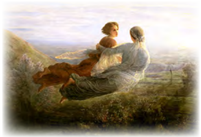
The Soul's Flight

Requested by: Court Queen of Peace #1023