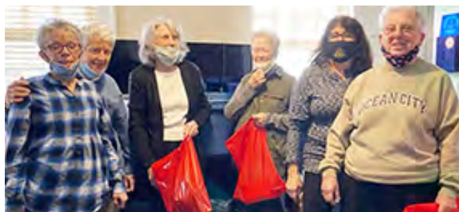
CDA members and other friends come together at Seamen Center and filled over 2,000 bags of toiletries and goodies

At our Catholic Daughter Day, members were asked to bring toiletries to be distributed to St. Johns Hospice for Men and the Seaman Center.