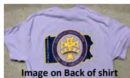
Image on Back of shirt

Printed on the front of shirt over the heart.