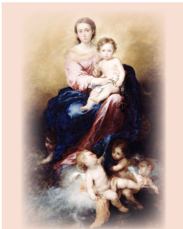
Madonna of the Rosary Bartolomé Esteban Murillo 1617-1682 ~ RestoredTraditions.com ~

Holy Mary we implore thee, By thy purity divine; Help us bending here before thee, Help us truly to be thine. Thou unfolding wide the portals Of the kingdom in the skies Holy Virgin, haste to mortals Shown the land of paradise.