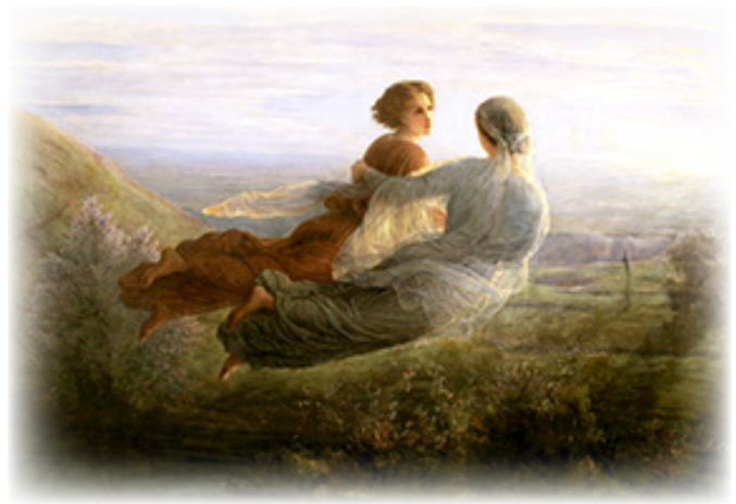
The Soul's Flight

Requested by: Court Queen of Peace #1023