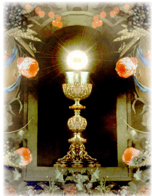
Eucharist in Fruit Wreath

People are encouraged to ask a priest to offer a Mass for several reasons: for example, in thanksgiving, for the intentions of another person (such as a birthday, wedding anniversary) or, as is most common, for the repose of the soul of someone who has died. Let us never forget the infinite value and graces that flow from the Sacrifice of the Mass. We receive Jesus—the true and everlasting nourishment and then must in turn nourish those who hunger for Him because He brings countless blessings to all who encounter Him. This will never cease to be our mission as we seek to reach our full potential as people of God. We are called to continue serving one another wherever and whenever the Lord calls us to the best of our abilities. The Holy Spirit inspires us to do so much good in Jesus' name so we can be a life-giving presence in the world. This is the joy and the good news of Jesus' Gospel.