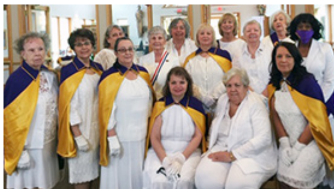
Above photo from 54th Biennial CDA State Convention in 2021. Will you be a part of the team this year?