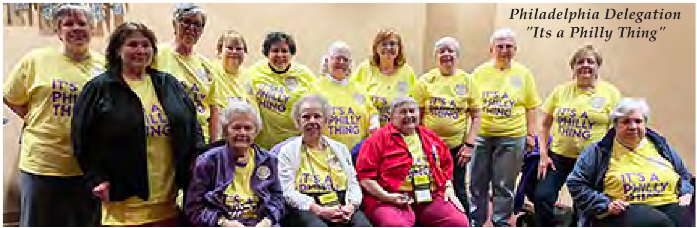
Philadelphia Delegation "Its a Philly Thing"