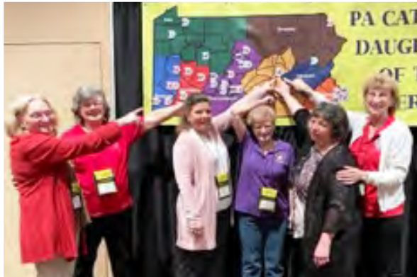
Delegation from Court Our Lady of Victory #588 points to their location on the map