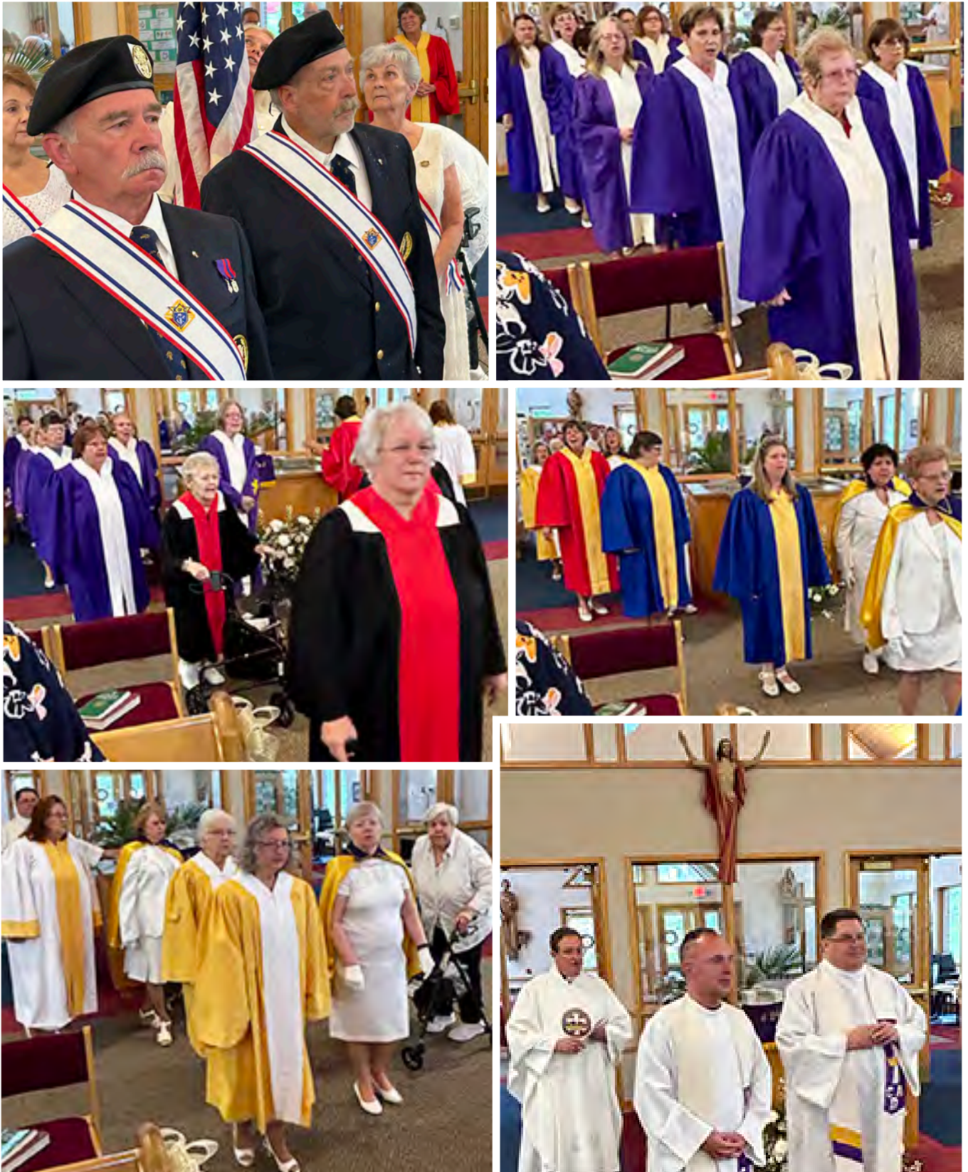
Opening Mass, St. John the Evangelist Church