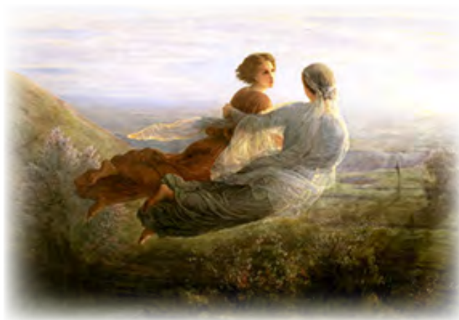
The Soul's Flight

Requested by: Court Queen of Peace #1023