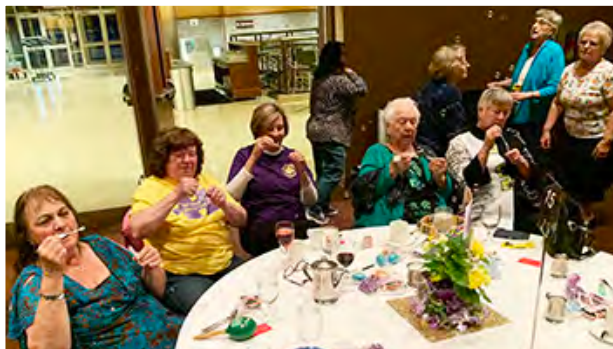
Blowing bubbles fun!