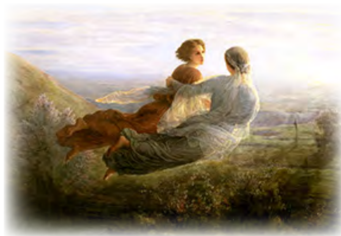
The Soul's Flight