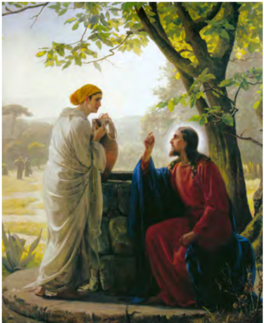
Jesus Speaks With the Samaritan Woman; Carl Heinrich Bloch 1834-1890